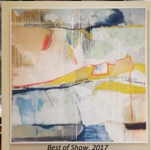
Best of Show, 2017